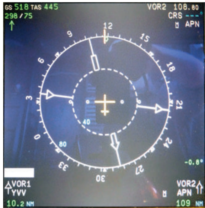
Figure 3: An example of a typical Bearing Pointer presentation within a glass-cockpit integrated avionics system. In this case, two Bearing Pointers are available for display and both have been selected to VOR stations. VOR #1 is tuned to the YVV VOR and is represented by the single-line Bearing Pointer and the lower left data field. The aircraft is on a bearing of 214° TO or 034° FROM YVV, at a distance of 10.2 NM (DME distance). VOR #2 is tuned to the APN VOR and is represented by the double-line Bearing Pointer and the lower right data field. The aircraft is on a bearing of 283° TO or 103° FROM APN, at a distance of 109 NM (DME distance).

In true backup navigation situations, bearing pointers can really earn their keep. Their versatility is the reason they've been incorporated into modern integrated avionics packages, long after ADF equipment has been excluded from many such systems, at least in the U.S. While they require a bit more thought and visualization than a basic CDI for navigation, they are not subject to the many errors of ADF/NDB systems when used for VOR or GPS navigation. Many pilots actually prefer a bearing