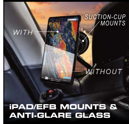
iPAD/EFB MOUNTS & ANTI-GLARE GLASS