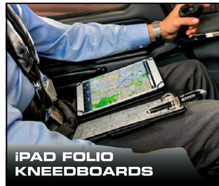
iPAD FOLIO KNEEDBOARDS

levels). If you prefer biking or horseback riding, you can thank famous American millionaire and philanthropist, John D. Rockefeller. Fearing the park would be overrun by automobiles, he began having narrow stone carriage roads built in 1913. Eventually, they stretched 45 miles through the park and across 17 bridges made from local granite and cobblestones. He also donated more than 10,000 acres for the park. If swimming or water activities are more your thing, there are several ocean beaches and fresh-water valley lakes to enjoy, though they