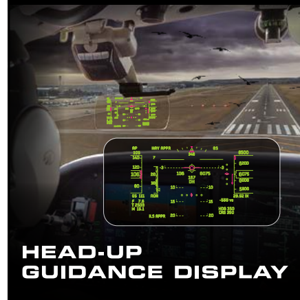
HEAD-UP GUIDANCE DISPLAY