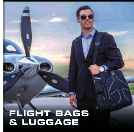
FLIGHT BAGS & LUGGAGE