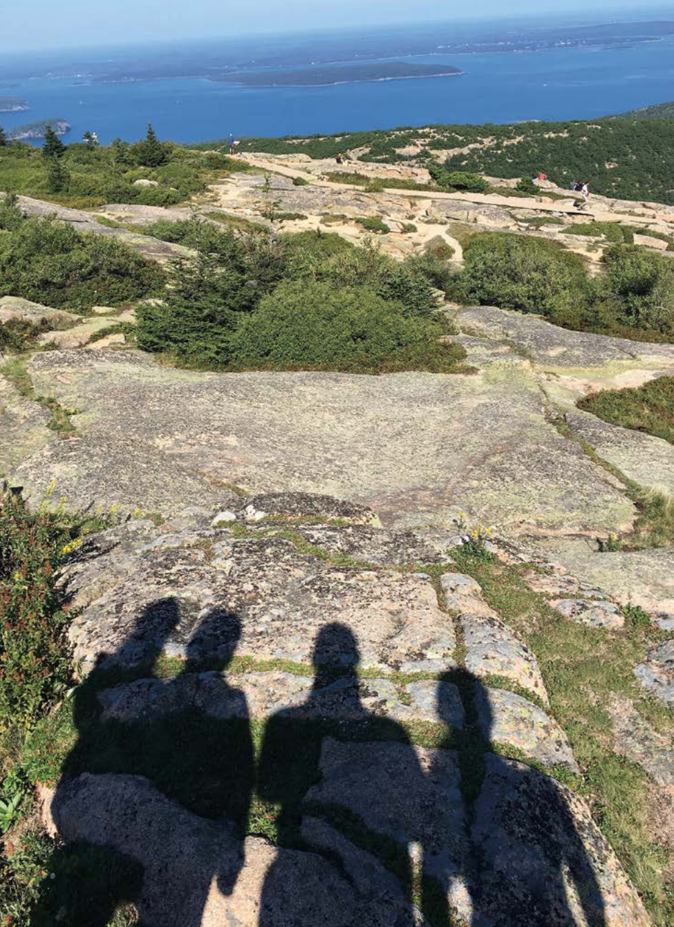
The author and family casting shadows atop Acadia National Park's highest peak. The paved loop trail atop Cadillac Mountain provides a 360-degree view of Mount Desert Island and the surrounding waters and islands. Cadillac rises to 1,530 feet above the sea and can be reached via the picturesque Cadillac Summit Road.

loss of soil and vegetation. Careless tourists have put several rare plants at the mountaintop into a threatened status. For any disappointment the calm conditions caused at Thunder Hole, the sedate winds were welcome atop the exposed peak.