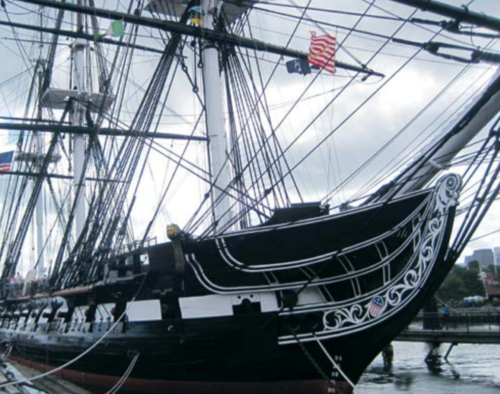
The USS Constitution is usually moored at the Boston National Historical Park in Boston, Massachusetts, though it is currently in dry-dock undergoing restoration at the time of this writing (January 2020). “Old Ironsides” is the oldest commissioned naval vessel still afloat, having been first launched in 1797. When not undergoing restoration or repairs, she’s open for tours year-round and typically sails a couple of times a year. She’s the only survivor of the original six frigate warships built to help form a U.S. Navy fighting force.

oversight of 61 official National Parks, it operates over 400 individual units, each into one of 19 different NPS naming designations. These include national monuments, lakeshores, seashores, memorials, battlefields, historic sites, etc. National Parks often begin as one of these lower tier sites before being expanded and upgraded to National Park status. The point is, if you have interest in the U.S. National Park System, there are units dotting the width and breadth of the country and they encompass far more than just National Parks, for example,