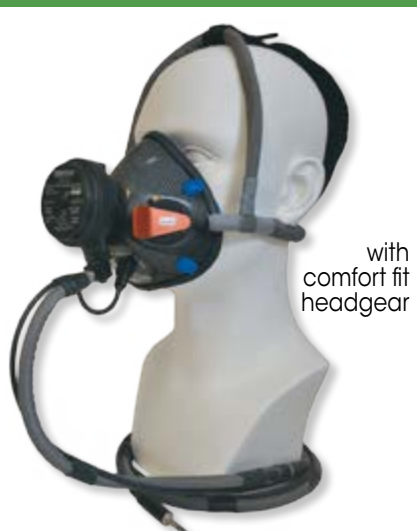
King Air Replacement Mask Carbon Fiber

aerox Phone (800) 237-6902 www.aerox.com