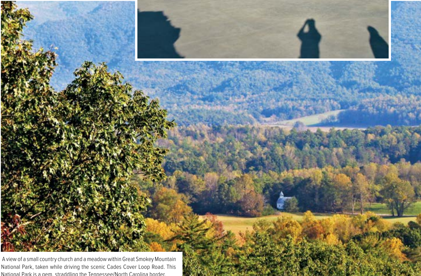
A view of a small country church and a meadow within Great Smokey Mountain National Park, taken while driving the scenic Cades Cove Loop Road. This National Park is a gem, straddling the Tennessee/North Carolina border.