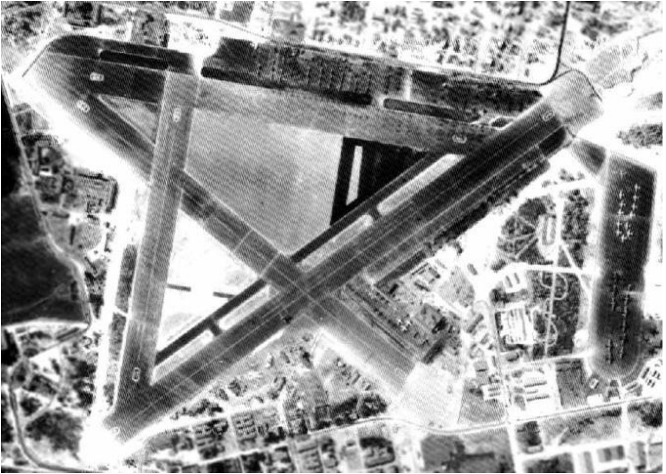
MCAS Ewa's layout in Dec. 1944. Note the two additional runways added after the Pearl Harbor attack.