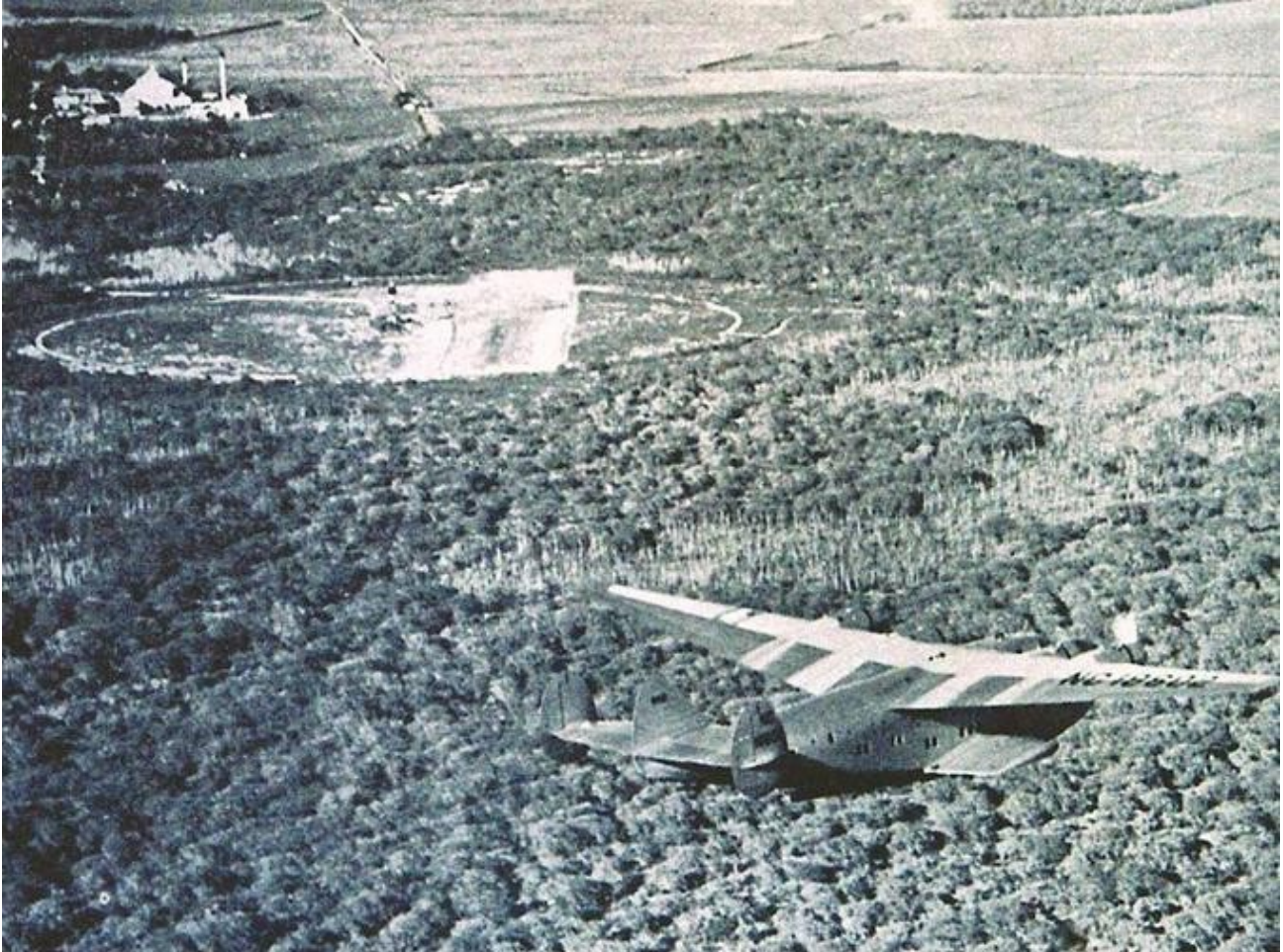
Pan American Airways Boeing 314 "California Clipper" passing the Ewa mast on its way to landing at Pearl Harbor in 1938.

Though never used for its intended purpose, the mooring mast remained standing, becoming a navigational landmark. Construction crews built a 1,500' emergency airstrip nearby the mast, and military squadrons from neighboring bases would often regroup overhead. Even the famous Pan Am Clippers used the mast as a navigational fix.