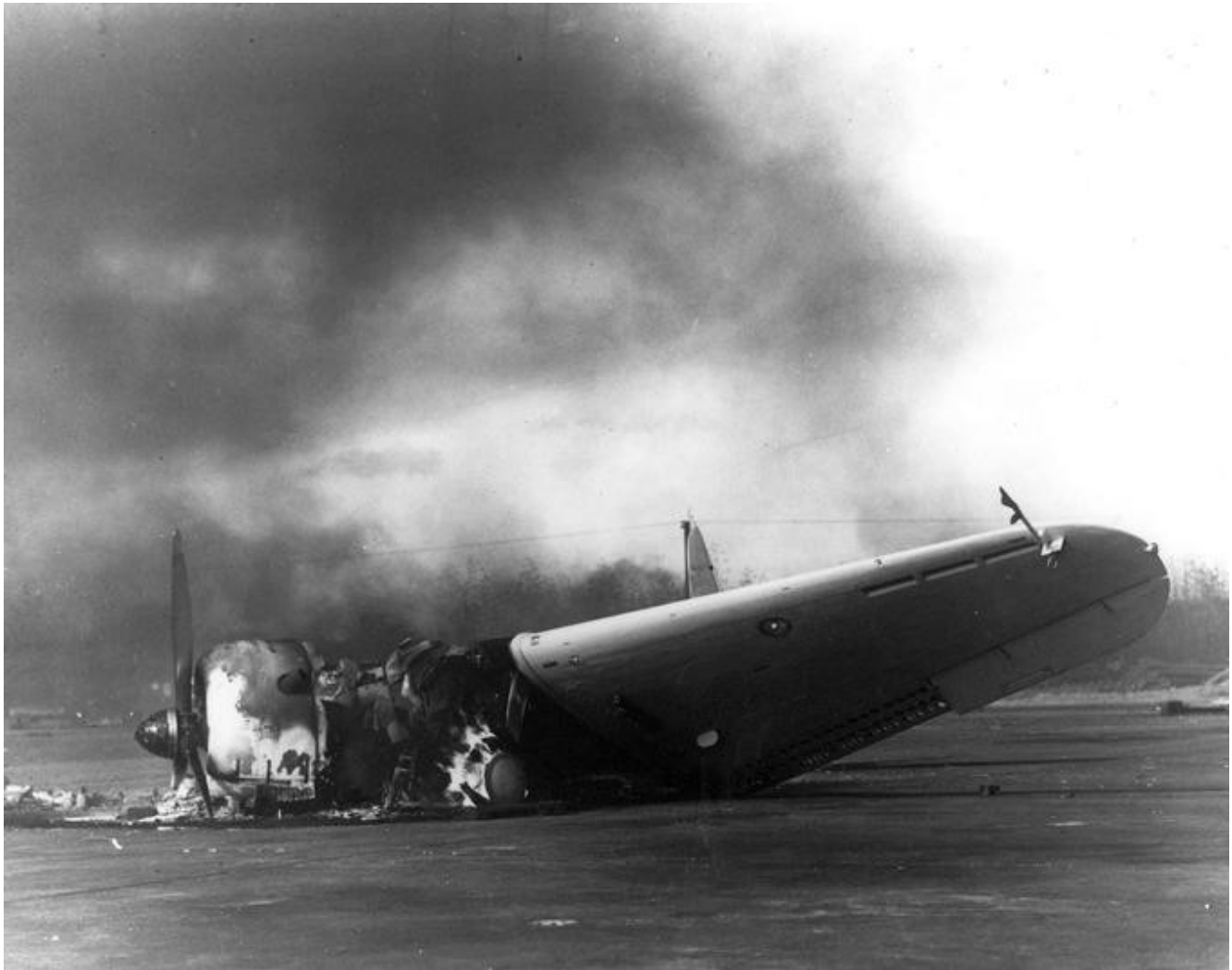
The remains of a Douglas SBD Dauntless dive-bomber burns on Ewa’s ramp on Dec. 7, 1941.

“targets of opportunity” were under equally deadly and immediate threat. Such targets included the four dozen military aircraft parked at Marine Corp Air Station (MCAS) Ewa, located 7 miles west of Pearl Harbor. Ewa was not among the several large military air bases on O’ahu specifically targeted in the two-wave Japanese attack. However, being nearby and directly under one of the aggressor’s flight paths to Battleship Row made it an easy target. So easy, in fact, that the aerial assault on Ewa actually preceded the attack on Pearl Harbor by two minutes. Ewa’s inventory of Marine Corps aircraft was virtually annihilated.