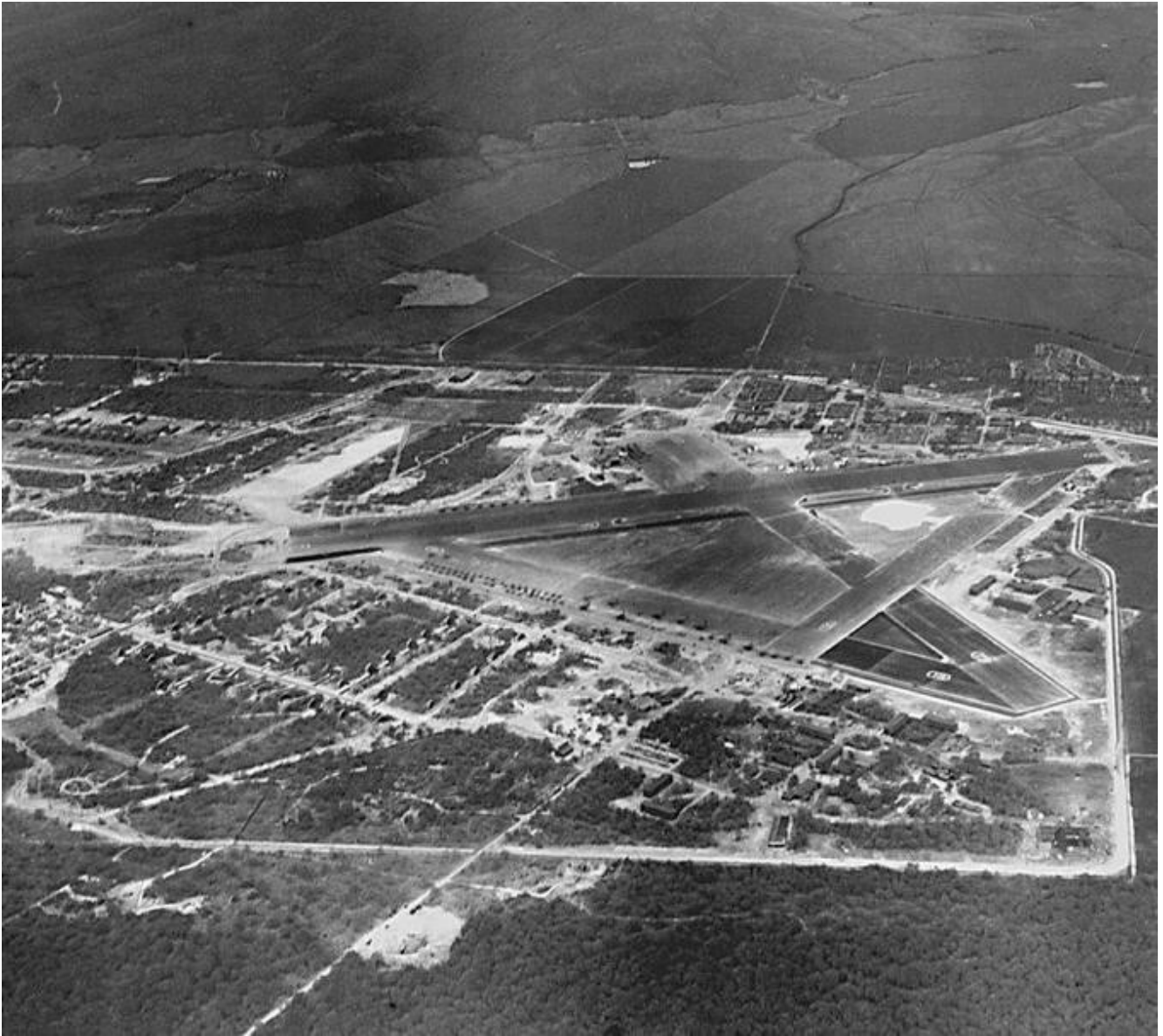
MCAS Ewa as it appeared near the end of WWII, in mid-1945. The scores of revetments can be clearly seen in the foreground.