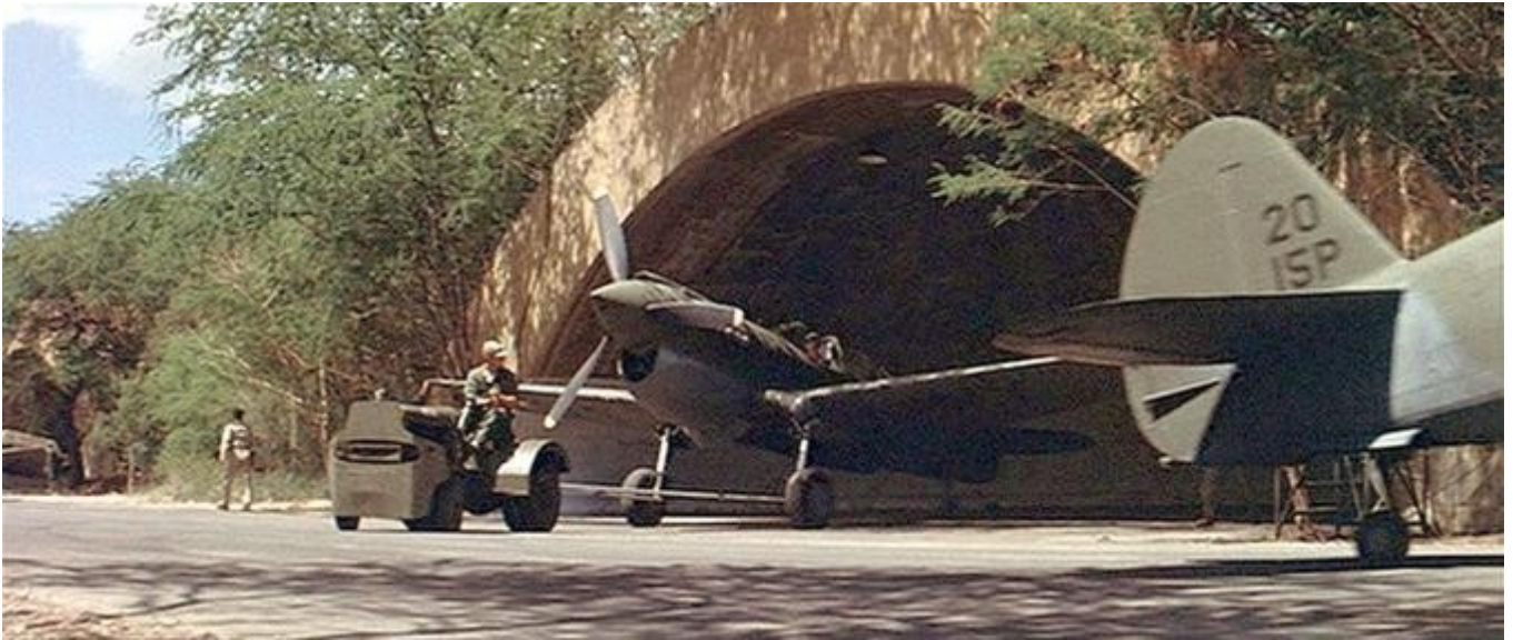
Ewa's historic revetments proved useful during filming of the 1970 WWII-classic, Tora, Tora, Tora .