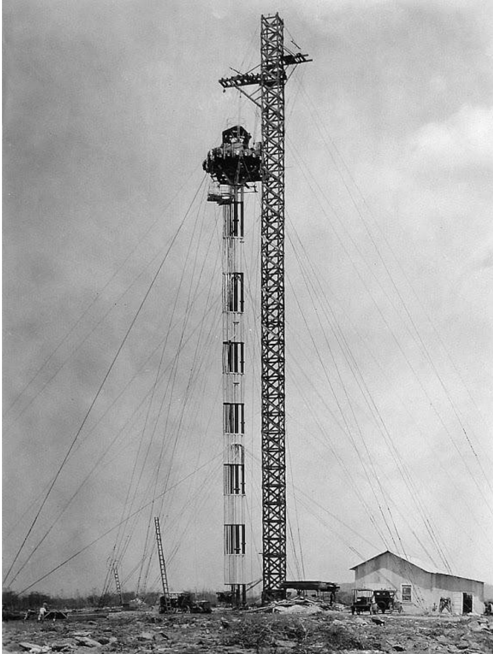
The 100-foot airship mooring mast erected in 1925 was the first aviation-related structure at Ewa.

in the eastern Pacific. This in turn insulated the Hawaiian Islands from further enemy attack, allowing them to rapidly become the primary staging point and training ground for military personnel and equipment headed to the Pacific Theater's war zones. However, MCAS Ewa's important contribution to the astonishing success of Allied forces in the waters and skies near Midway Atoll is now largely forgotten. Ewa became the crossroads for Pacific Theater Marine Corps Aviation. Today, 75 years after Japanese aircraft riddled MCAS Ewa with bullets, many historical reminders of its role in the build-up to the Battle of Midway remain. Sadly, a good number are undocumented, most are unprotected, and some are facing the imminent threat of destruction from urban encroachment.