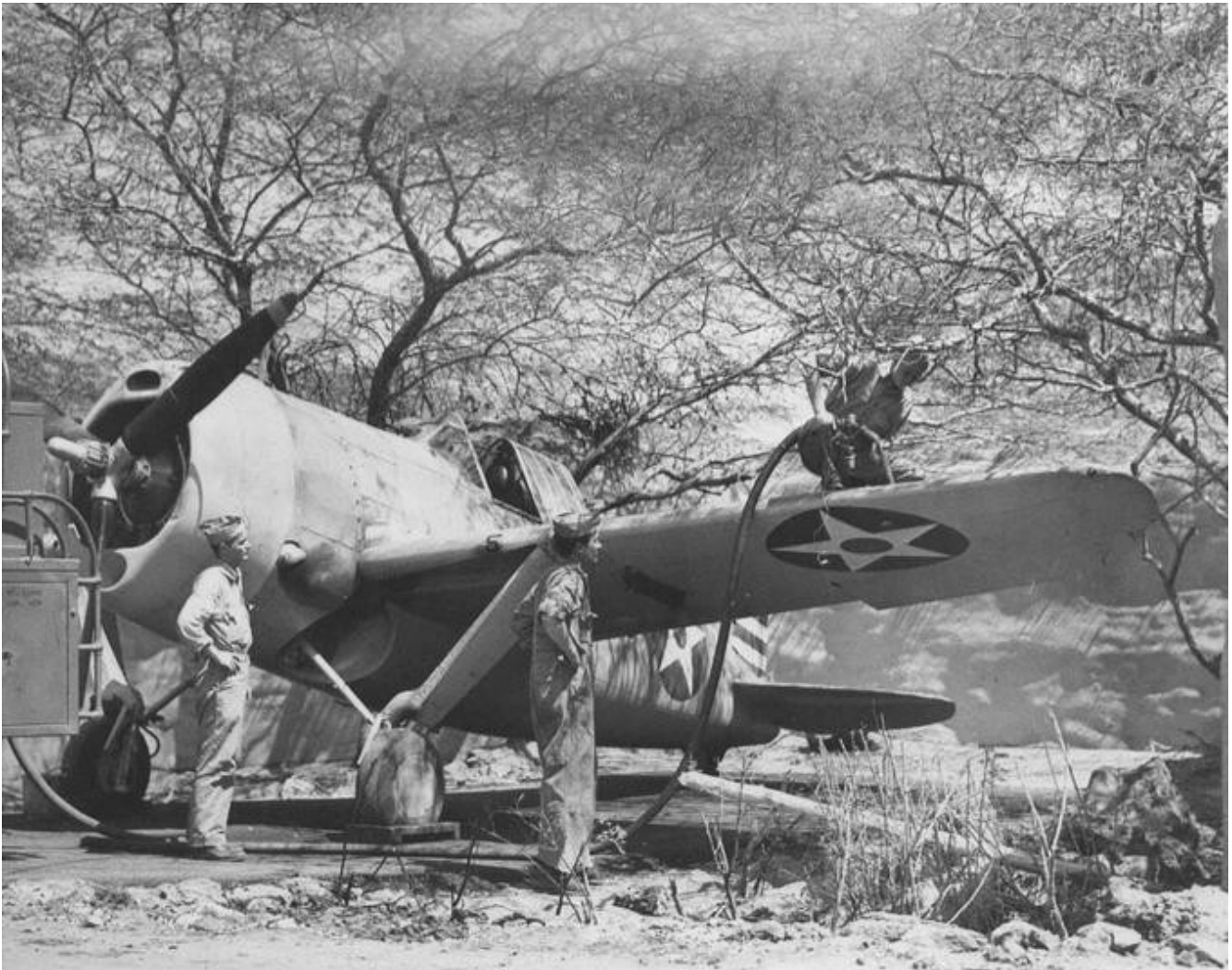
A Brewster F2A Buffalo being refueling at Ewa in May, 1942. Note the attempt to hide the aircraft under the thorny Kiawe trees and the sandbag revetment in the background.

Clean up at Ewa began immediately. Other O'ahu airfields were severely damaged and many offered little in the way of cover for their remaining aircraft. Everyone expected Japanese forces to make additional attacks on the Hawaiian Territory, so protecting the few remaining aerial assets was a high priority. No aircraft revetments yet existed at Ewa, but the air station offered two advantages: two useable runways and natural camouflage from nearby high grass and dense stands of Kiawe trees. Aircraft deemed repairable were immediately pushed into the undergrowth and covered with palm leaves, branches, tarps, nets, or anything else at hand. An Army pursuit (fighter) squadron moved in too, awaiting repairs to their home runways at Wheeler Field. Crews laboring to build neighboring NAS Barbers Point were reassigned to expand Ewa, which included enlarging the two existing runways while adding two more.