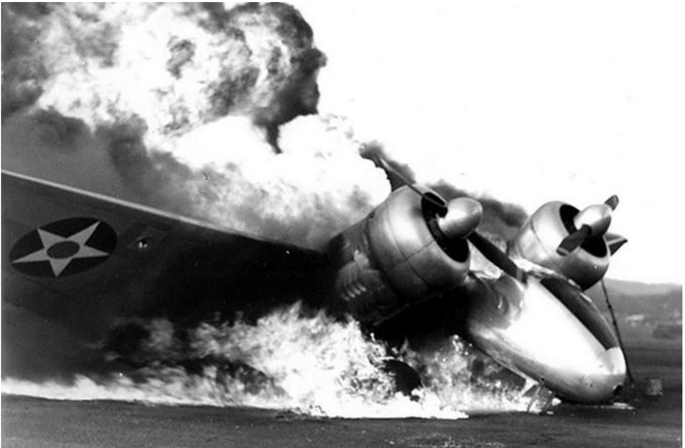
A Lockheed JO-2 Electra Junior burning at Ewa during the Pearl Harbor attack.

Of these 49 aircraft, 33 were destroyed while 16 sustained serious damage. The base's emergency response vehicles were badly shot up too. While Ewa had suffered terrible punishment, their losses paled in comparison to those wrought at Pearl Harbor and other military bases across O'ahu. Because Japanese aircraft passed over Ewa on their way to bomb their primary targets or upon returning, few had spare bombs to drop on Ewa. Thus, while the enemy strafed Ewa heavily throughout the morning, igniting fires across the base, the runways and ramps remained operational afterwards, and free of bomb craters. Leaving Ewa's infrastructure relatively intact was a seemingly small miscalculation, but the base proved critical to protecting and operating the few combat aircraft that remained airworthy. Ewa became ground zero for the rapid resumption and intensification of the build-up of America's Pacific aviation fighting force.