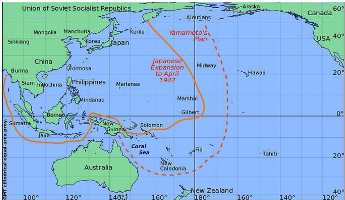
A map showing Japan's control over the Pacific leading into the Battle of Midway. Had they prevailed, Japan could have controlled further eastward (to the dashed line). The U.S. victory at Midway, kept the eastern Pacific under Allied control and shielded the Hawaiian Islands from further attack.