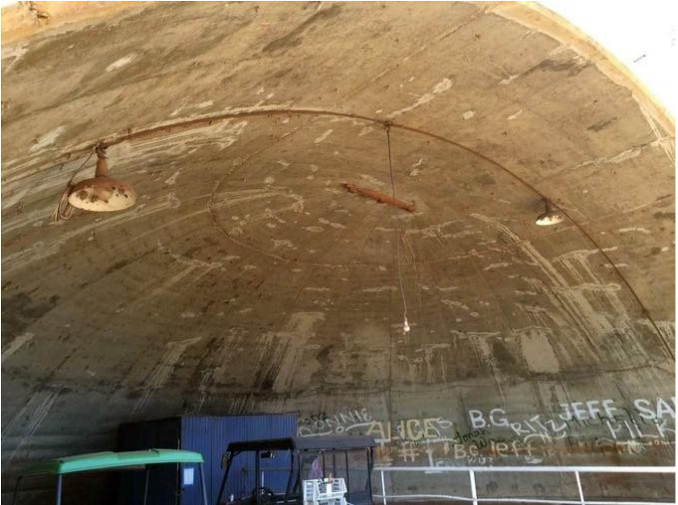
Hastily constructed revetments that protected aircraft bound for the Battle of Midway still exist today within the ruins of MCAS Ewa, O'ahu, Hawaii.