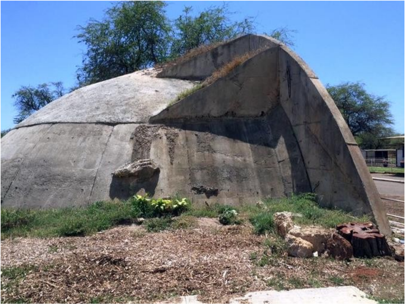
Hastily constructed revetments that protected aircraft bound for the Battle of Midway still exist today within the ruins of MCAS Ewa, O'ahu, Hawaii.