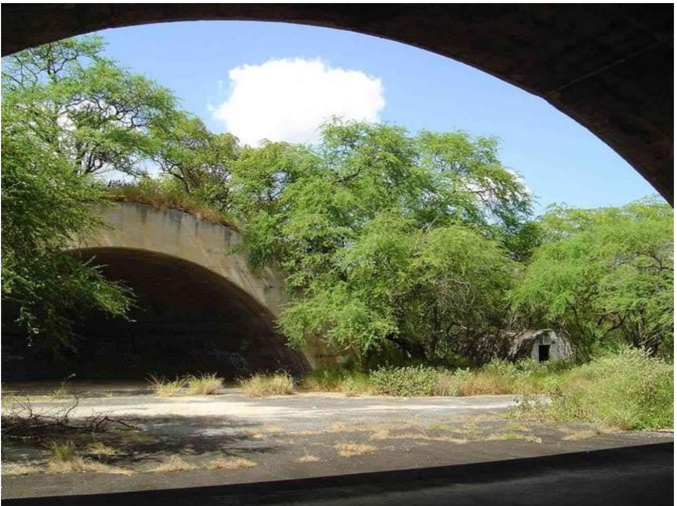
Hastily constructed revetments that protected aircraft bound for the Battle of Midway still exist today within the ruins of MCAS Ewa, O'ahu, Hawaii.