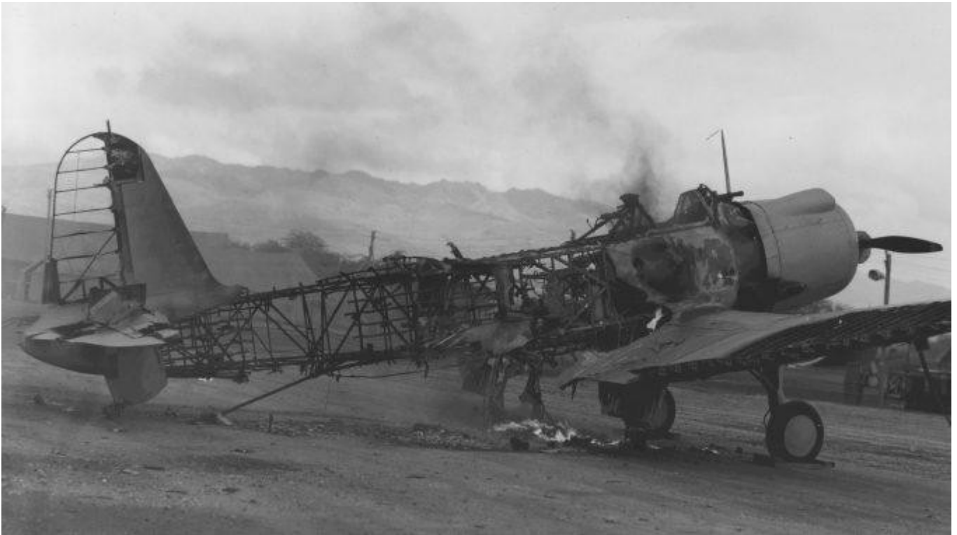
A Vought SB2U Vindicator dive-bomber, still smoldering, shortly after the Japanese attack on Ewa and Pearl Harbor.