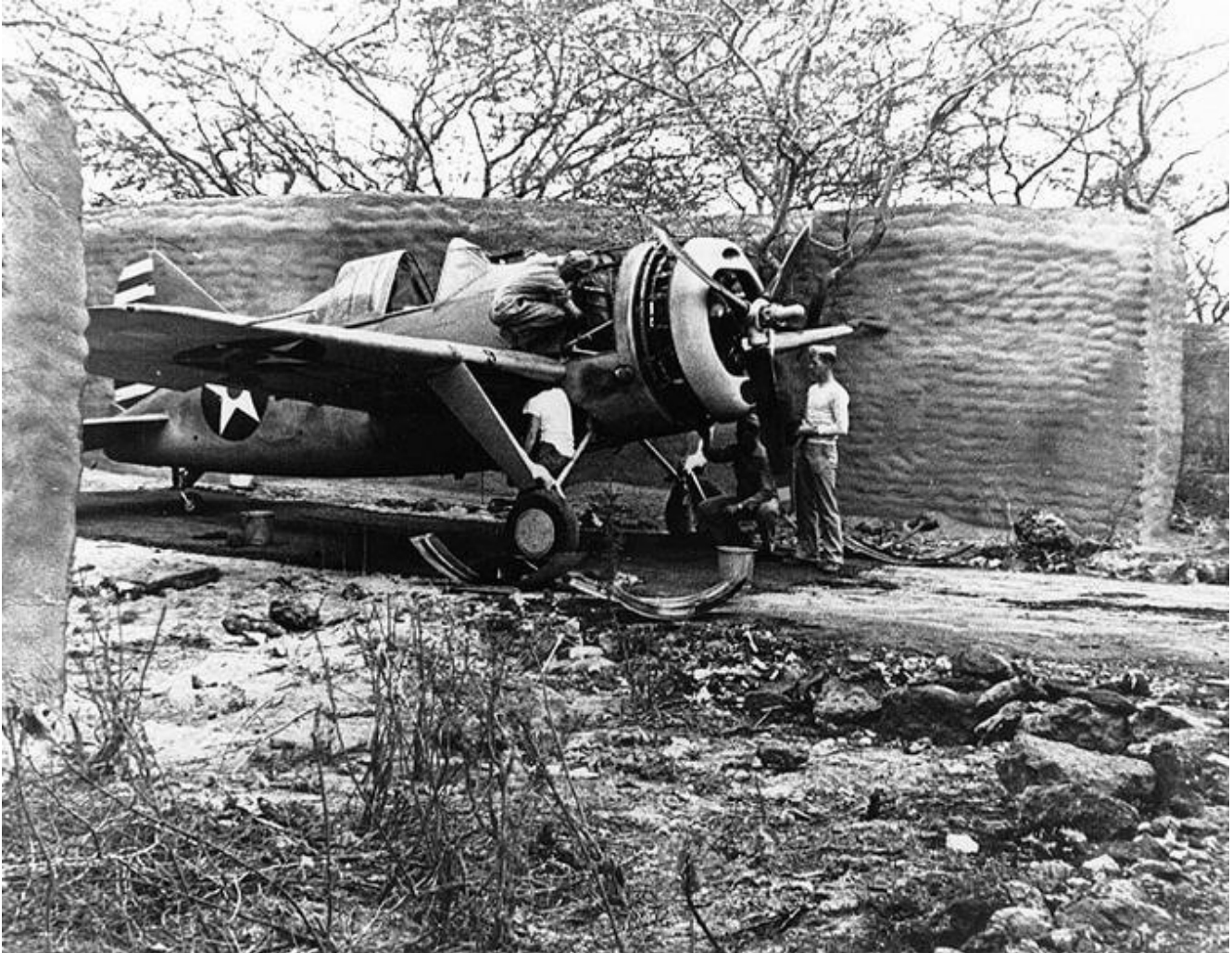
A Brewster F2A Buffalo (probably from Marine Corps Fighter Squadron VMF-221) undergoing maintenance in one of the early sandbag and stucco revetments at MCAS Ewa in April 1942.

revetments survive in better condition than their later, sturdier counterparts. The first domed revetment in Hawaii appeared at Ewa and several geometric variations followed. Many of them survive in amazingly good condition for their age; some relatively easy to access and some buried in dense vegetation. All remaining revetments have one thing in common; they hid and protected aircraft bound for the Battle of Midway.