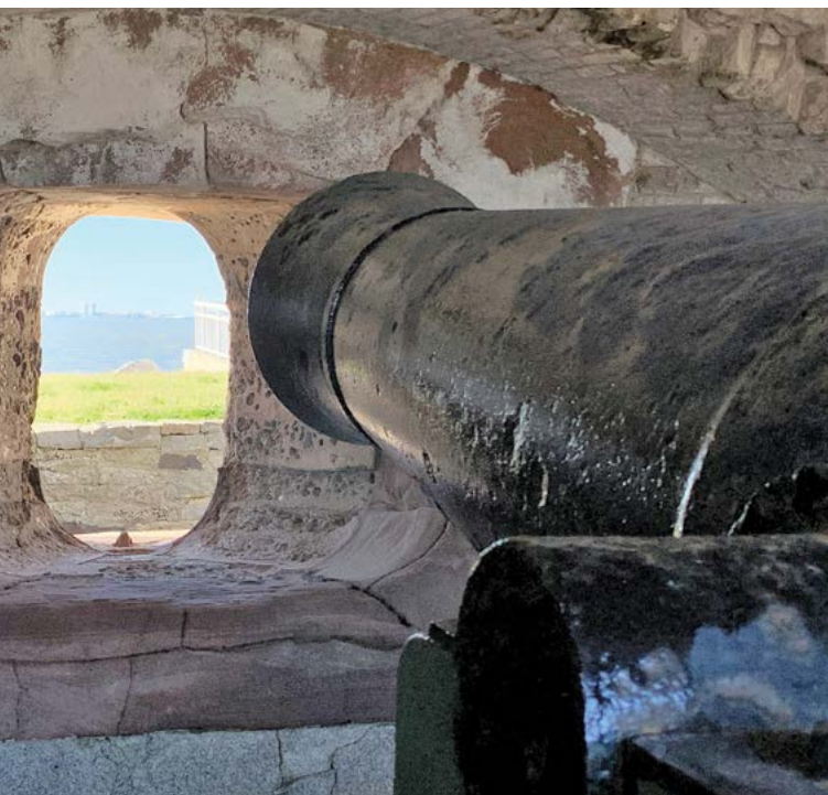
A cannon aimed through a lower gun port of the left flank wall of Fort Sumter. A section of Charleston skyline can be seen in the background.

the American Revolution and the Civil War. Interestingly, Charleston's most famous events were dramatic losses for what we would now call "The United States" in both conflicts. Sites, memorials and museums dedicated to one or the other can be found scattered throughout the Historic District and surrounding the harbor.