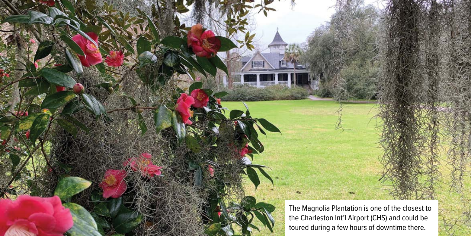
The Magnolia Plantation is one of the closest to the Charleston Int'l Airport (CHS) and could be toured during a few hours of downtime there.