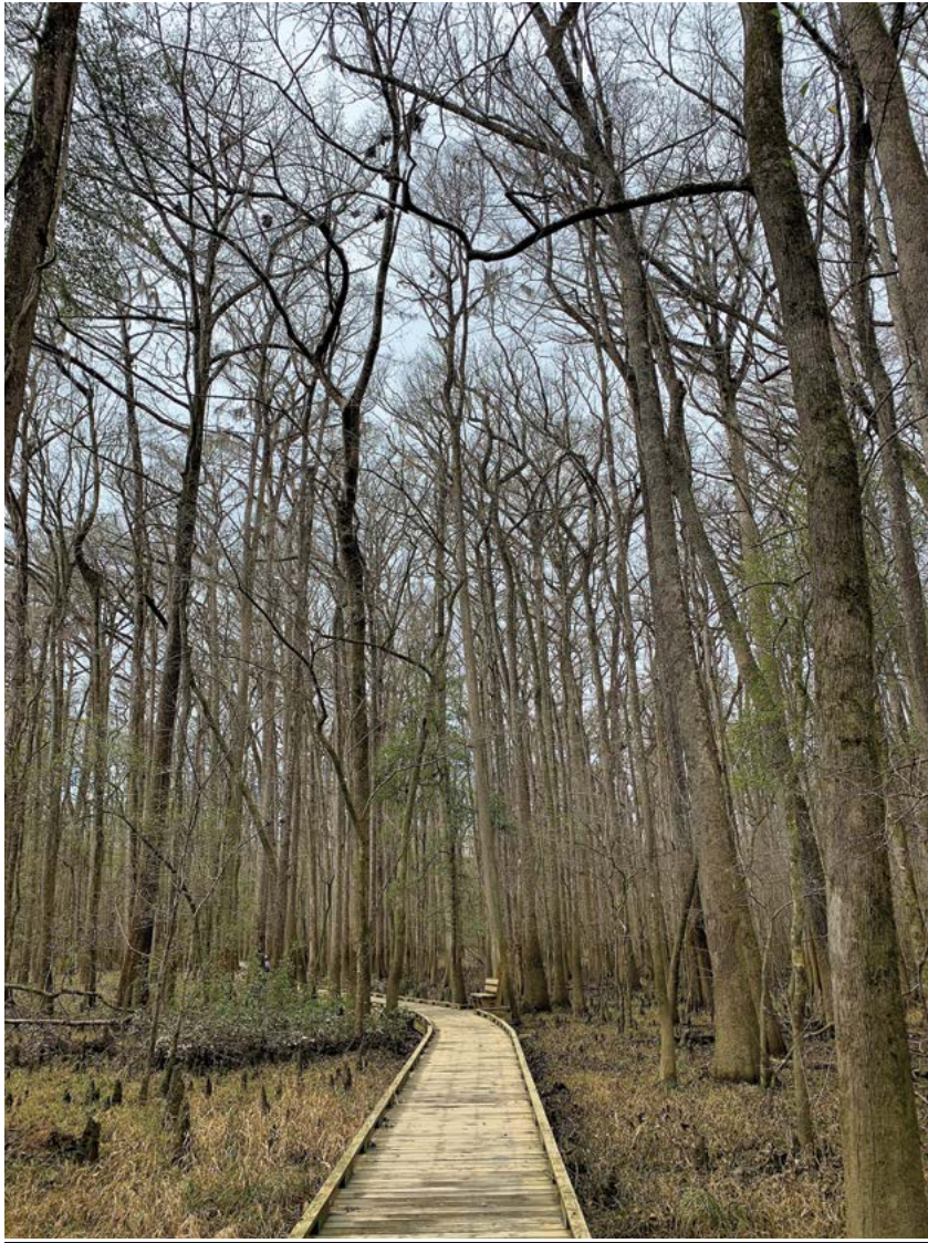
Congaree National Park's Boardwalk Wilderness Trail allows visitors to stroll among the old-growth floodplain forest without getting their feet wet. Many of the trees are some of the largest of their species known to exist.

ended soon after, post-war economics in the South kept advancement on the building to a crawl and another decade was needed just to complete the main structural elements. The interior was completed between 1881 and 1891. Finally, it was not until 1907 that the exterior was completed. This 56-year construction timetable is one of the longest for any U.S. state capitol building.