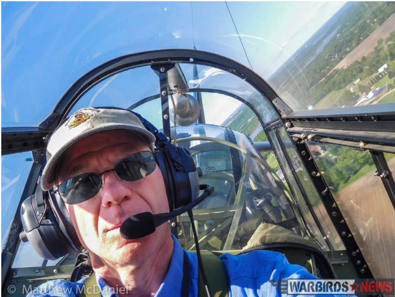
The author maneuvering through some moderate-bank turns in a dual-control TBM-3E.

horsepower available when operating from carriers or at maximum takeoff weights. While this reduced engine life, they weren't the ones paying for cylinder replacements or engine overhauls! Given our light loading, 41" was plenty for our needs and we broke ground at 95 Knots Indicated Airspeed (KIAS), having used under 1,000 feet of runway. We climbed at 120 KIAS. In the practice area, Brad reset the power for a sedate 150 KIAS economy cruise, while the Wright R-2600's 14-cylinders burned about 80 gallons of avgas per hour (GPH). That's how Deckert typically cruises in order to get 3 hours endurance plus a healthy reserve (or roughly 450 nautical miles range) out of the 325 gallons the Avenger carries internally. But, the plane will happily cruise at 170 KIAS in exchange for 100 GPH. For a high speed cruise of 200 KIAS, the cost rises sharply to 150 GPH.