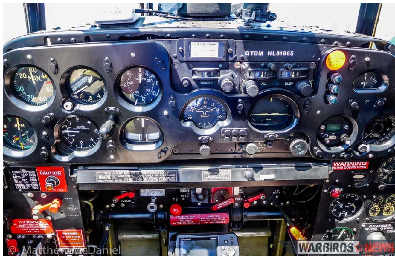
The pilot's main instrument panel on Deckert's TBM remains as close to original as possible. The critical trim indicators are situated front and center. Flap and gear levers are at the lower left corner of photo.

Avengers now use this area for a passenger seat, though a few (including Deckert's TBM-3E) have installed a second set of primary flight controls, a throttle, and basic instruments to create a co-pilot's position. Even with those modifications, many critical controls remain accessible to the pilot only. Therefore, before we began maneuvers, Deckert and I agreed on verbal commands to coordinate his manipulation of the secondary controls (that my co-pilot's position lacked) with my handling of the primary flight controls.