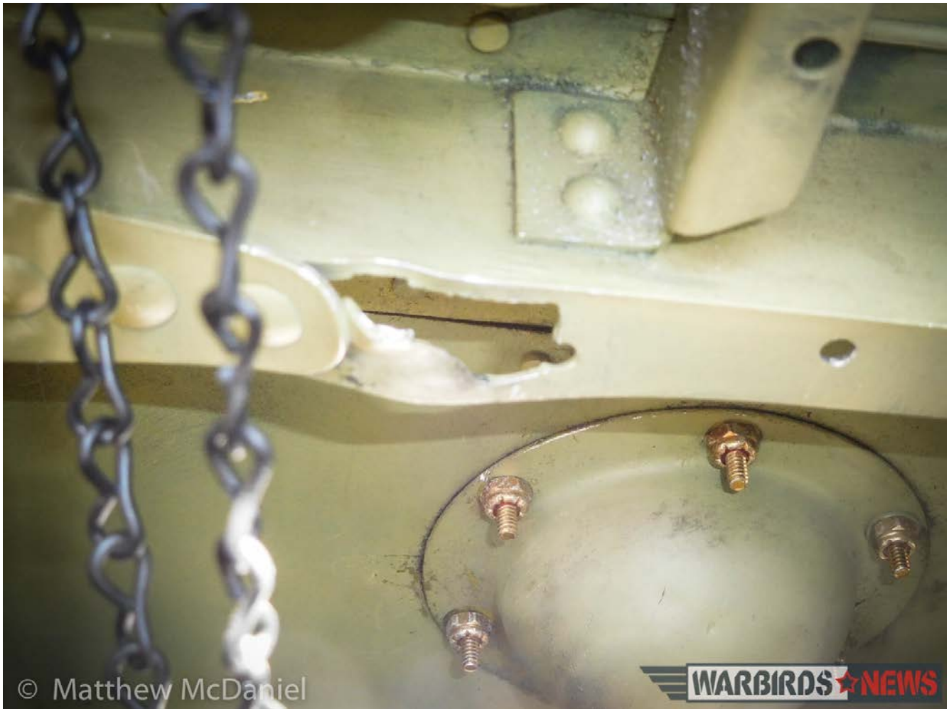
A bullet hole from 1945 in a fuselage stringer near the pilot's right hip area is eerie evidence of Bu. #85828's combat history.