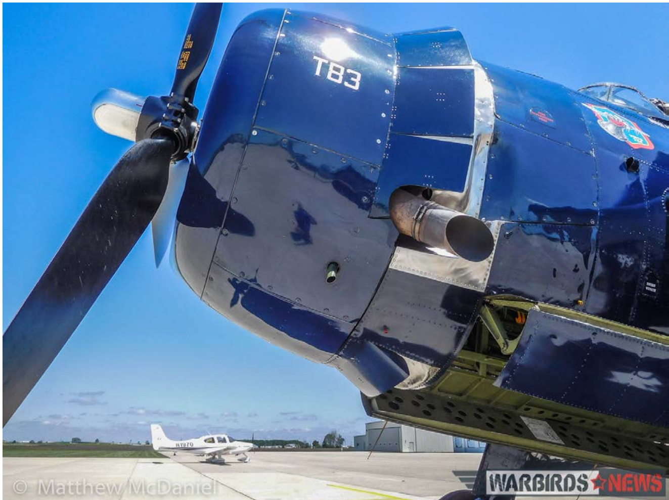
The nose of the Avenger towers above the author’s ride to the event (a Cirrus SR-22). The massive cowl flaps encircling the TBM’s nose can increase ground roll by 30% if left open during takeoff.

and inquired half-jokingly, “I assume the smoke is on and that we’re not on fire!” Brad laughed and replied, “You can tell, huh!” Indeed, I could. Along with the smell, there was a hint of smoke passing under the wings and a reflection of the haze trailing behind us in the Avenger’s huge greenhouse canopy. With a couple-G pull, we climbed and headed for the practice area, where I could sample for myself the flying qualities of the infamous Turkey.