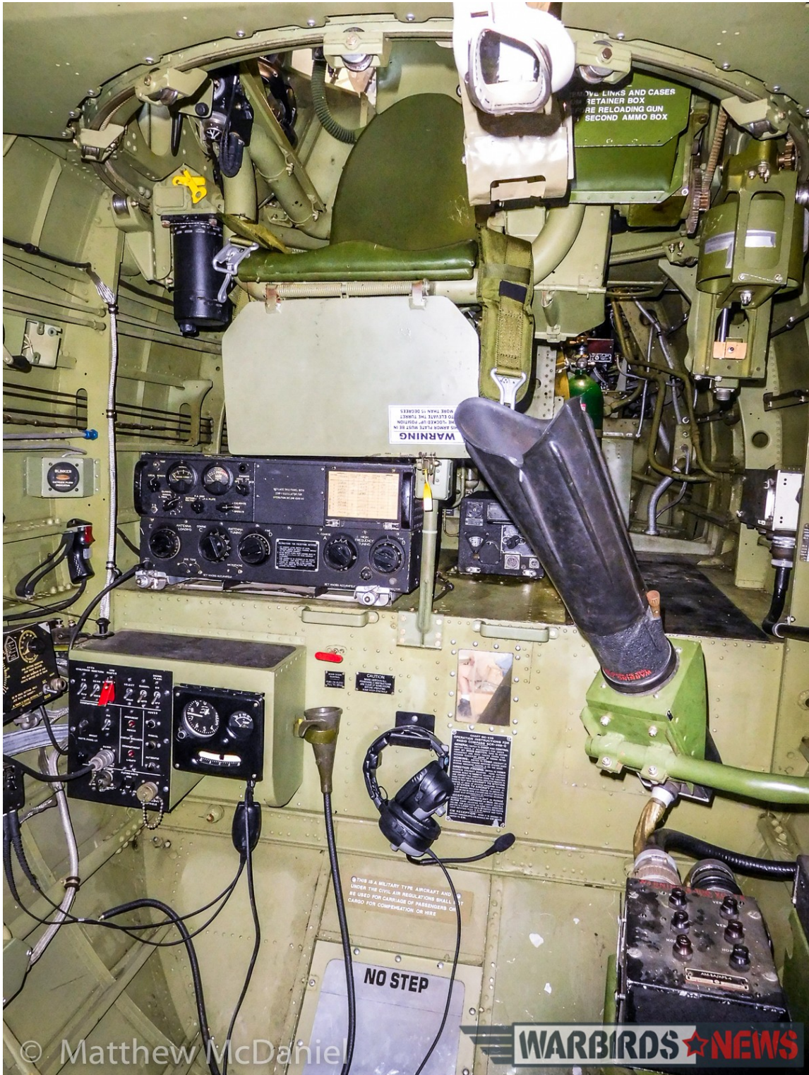
The bombardier/radioman position in the lower tail of Deckert's TBM bristles with original equipment. Also visible is the turret gunner's seat (top left) and the "tunnel" leading forward to the mid-cabin area.