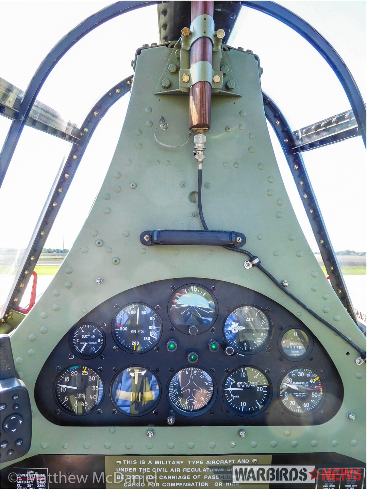
The co-pilot's instrument panel in Deckert's dual-control TBM-3E contains basic flight and engine instrumentation and landing gear position indicators.