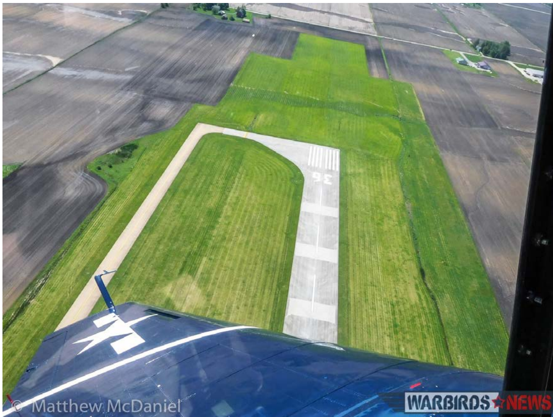
Looking down at the approach end of VYS's runway 36, during a left overhead break for landing on Runway 25.

Those drop tanks not only add visual authenticity to this TBM, but they are also functional. They would have added roughly an hour's endurance to a combat Avenger in WWII. Today they each store 58-gallons of smoke oil for air show performances. Currently, the smoke system is set up to burn at 4 gallons per minute. This produces prodigious amounts of smoke, yet the smoke oil is currently only plumbed through half of the TBM's exhaust system, meaning that smoke output could be doubled should Deckert ever desire it.