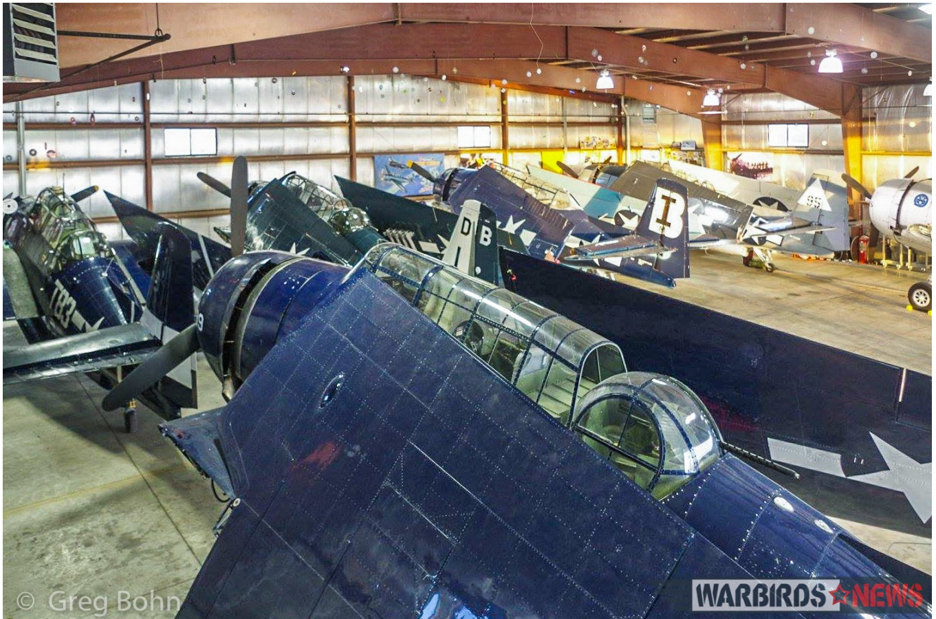
Six of the seven TBM's to attend the 2017 Gathering protected from the stormy weather, aircraft carrier storage deck style, within the City of Peru's hangar.

There are approximately 20 airworthy examples of the hulking Grumman Avenger torpedo-bomber in North America (all being TBM variants built by General Motors under a licensing agreement with Grumman). While about half of them (10) attended last year's event, as many as 16 were slated to attend this year. Unfortunately, widespread volatile weather forced many to abandon their trek. In the end, 7 TBM's completed the journey this year. They were joined by several other warbirds, including (but not limited to) many T-6/SNJ's, T-34s, Stearmans, an F-86 Sabre, and even a MiG-17. While the challenging weather conditions kept most general aviation planes in their hangars and many spectators at home, it was far from a washout. About 4,000 people still came out to Illinois Valley Regional Airport (KVYS) to enjoy the show.