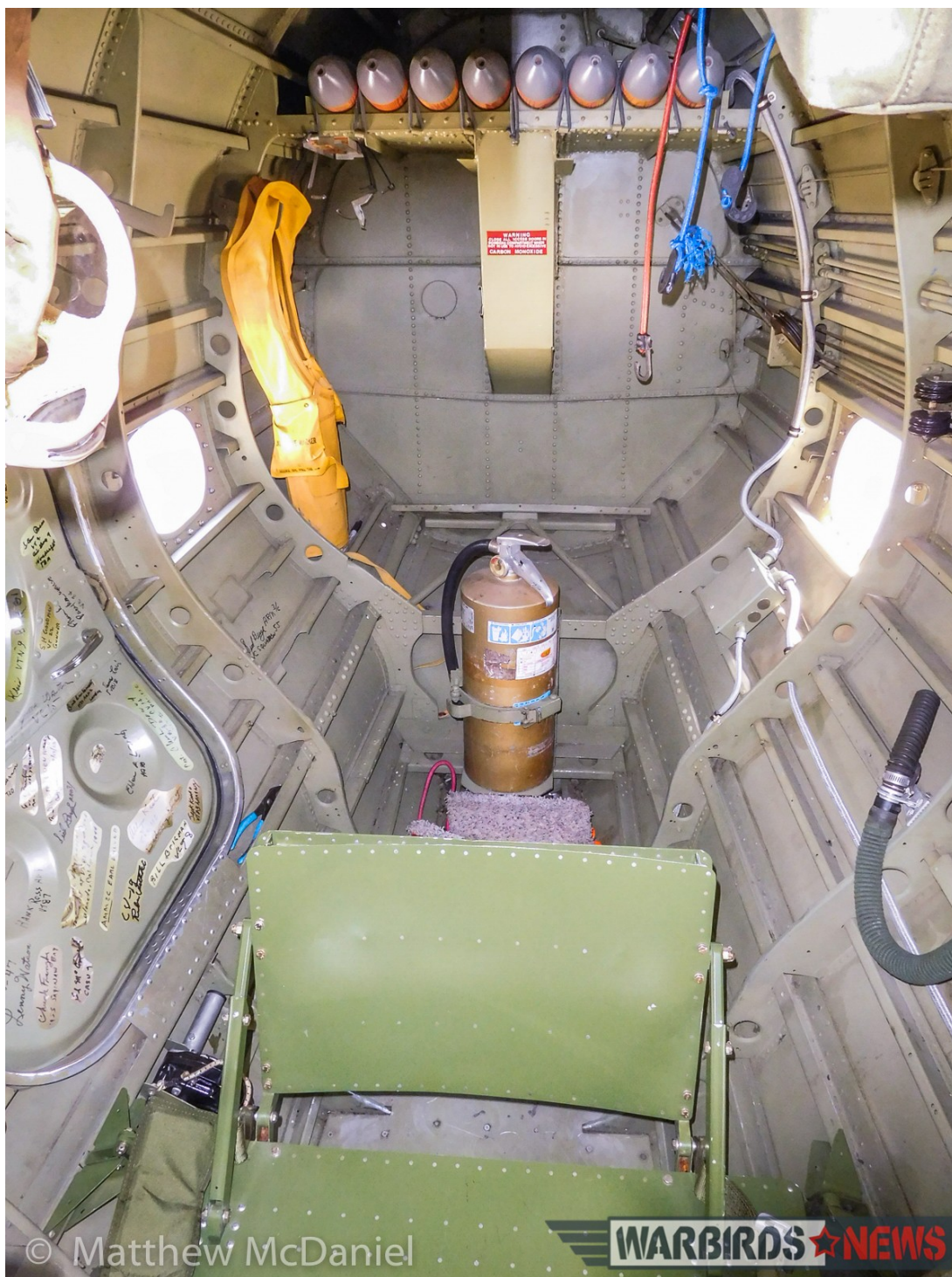
The bombardier/radioman position in the lower tail of Deckert's TBM (looking aft). Earlier versions of the TBM included a ventral machine gun and additional window when the fire-extinguisher sits in this later -3 model. Note the signatures on the compartment's entry hatch; They are those of WWII-vet TBM crew members who've been reunited with the TBM by Deckert and his team.