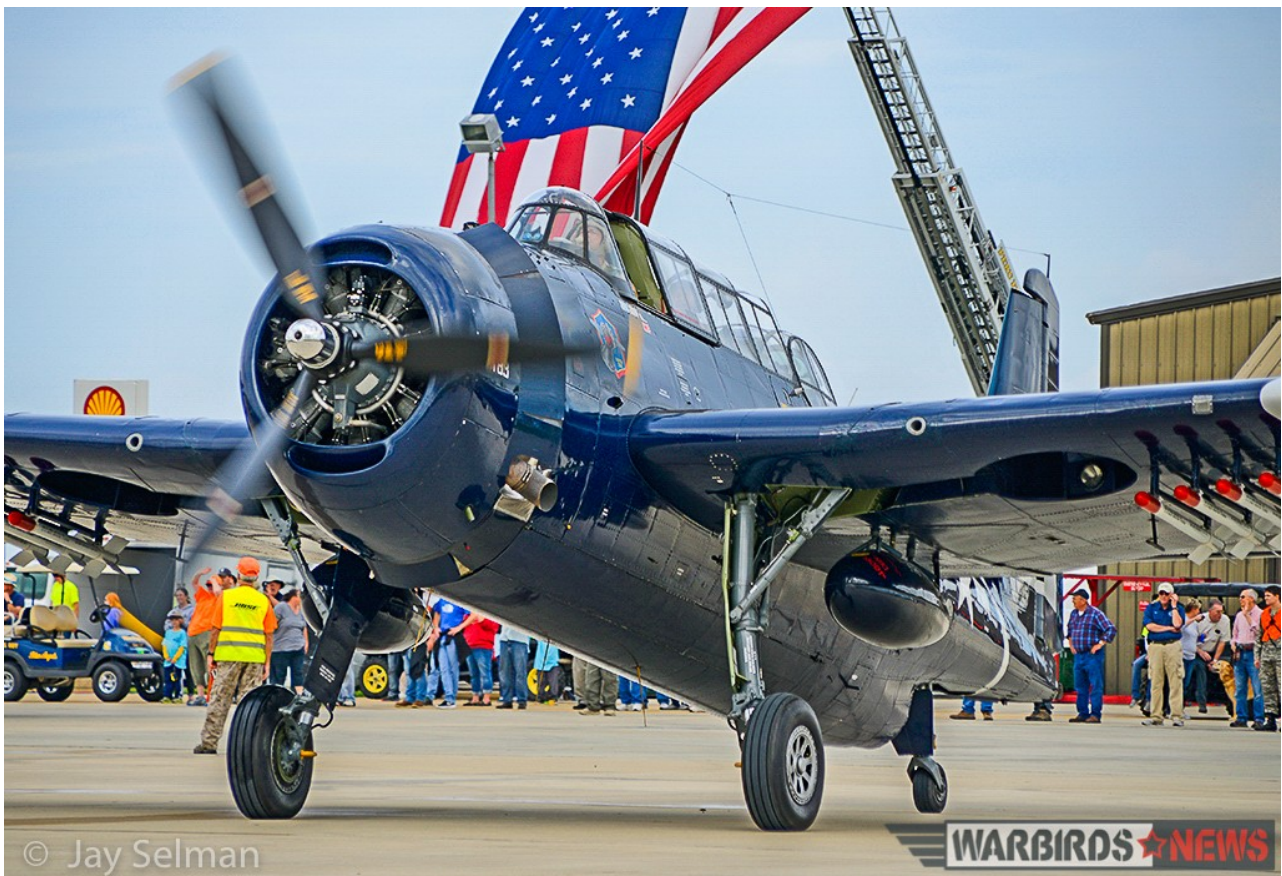
Brad Deckert taxiing out during the 2017 TBM Gathering. To appreciate the true size of the TBM, consider that each teardrop-shaped drop tank is larger than a 55-gallon barrel.

Prior to taking the active runway, Brad announced that the trims were set for takeoff. He added, "If you try to takeoff in a TBM with the pitch trim still in the landing position, you'll just roll off the end of the runway." I had to take his word for it, as the trim controls and indicators are not visible from the co-pilot's position. He also cautioned that the cowl flaps should be closed for takeoff, as the drag penalty from leaving them open increases the takeoff roll by a whopping 30%!