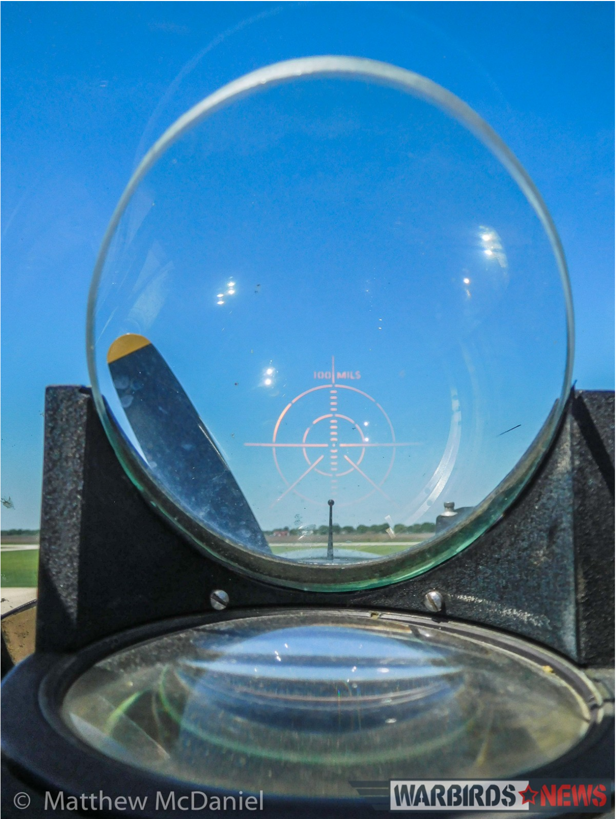
Deckert is understandably proud of the functional, electric, glass-projection, gun site. It was the WWII-technology version of a Head's Up Display (HUD). It's skewed alignment is due to the resting angle of the big taildragger on the ground.