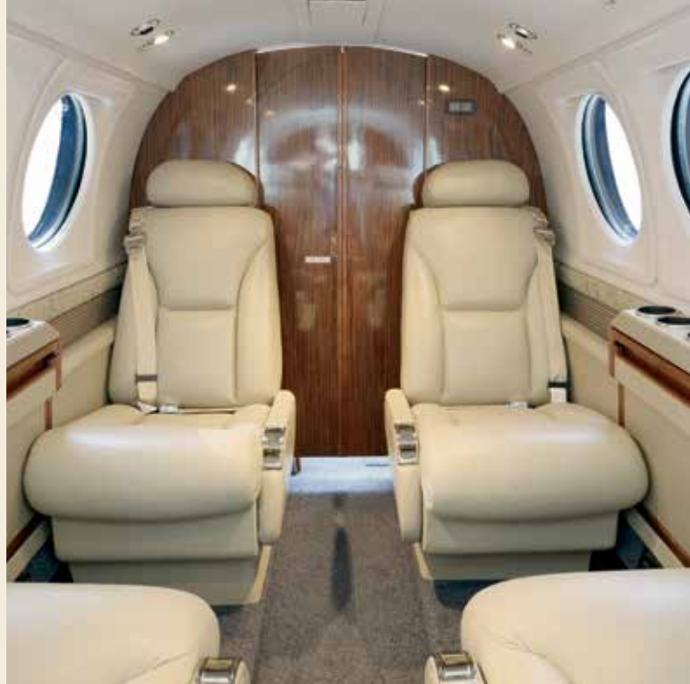
The spacious King Air 250 interior provides a productive work space with integrated work tables and 115V AC outlets for laptop use, but also touts luxury and comfort when you’re ready to relax.

Visually, the most obvious modification on the 250 is the winglets, which have been around for decades. Even Hawker Beechcraft has carried them on its larger King Air variants for many years, so they are almost considered “old hat.” Nonetheless, they can still do for nearly any wing, what they were designed to do all those years ago. That is, they increase effective span, lift, and aspect ratio, while decreasing induced drag, and, thereby, increasing range, speed, rate of climb, and fuel efficiency. So, what could possibly be the downside of such magical devices? Primarily, they just