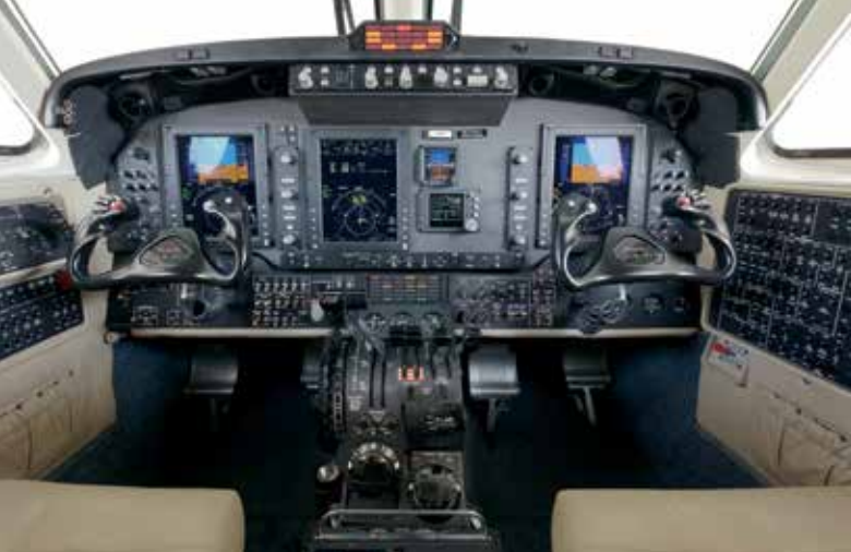
With the ProLine 21 avionics suite, as with all modern glass cockpits, there is never a lack of information available to the pilot.

with that comes a big jump in short field capabilities. Historically, King Air pilots have always been able to count on being able to utilize airports that small bizjet operators would avoid due to runway distance requirements, which is one of the major reasons the King Air has had its staying power. It fills a significant niche in personal and business flight operations that require visiting smaller communities that only have smaller airports. All too often, those community airports are too small to accommodate even small bizjets, but can accept King Airs with room to spare. The 200GT is certainly no slouch in this department, touting published takeoff distances of 2,579 feet at a