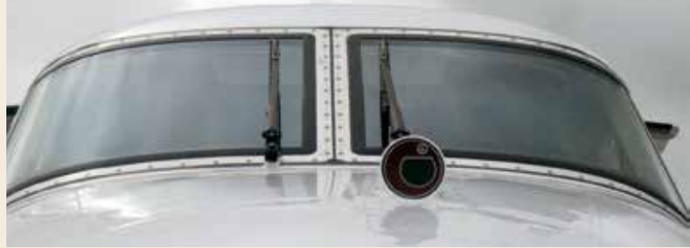
The 250 is the first in the 200 family to receive the option of adding an Enhanced Vision System (EVS) infrared camera system. Mounted on the upper nose, the EVS camera's picture is displayed on the Multi-Function Display (MFD).

At this point, most pilot reports would head off describing the 250's flight characteristics, performance numbers, and various amenities. However, since no one