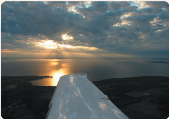
Sunset over Green Bay and Door County – between stops No. 98 and No. 99 (Ephraim and Sturgeon Bay) at 20:03 CDT. Blue Kids One is flying south over the Door County Peninsula with Green Bay (the water, not the city) off their right wing.