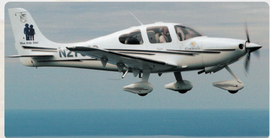
Blue Kids One in flight near Superior and Madeline Island (taken about 16:15 CDT), between airports No. 79 (SUW) and No. 80 (4R5).