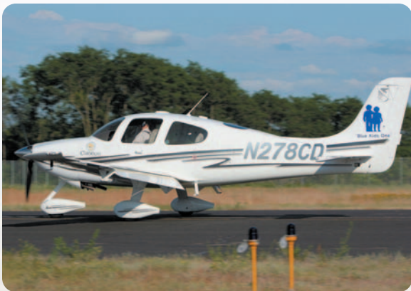
A "touch and go" landing on Runway 4 at Wausau Downtown Airport (AUW), No. 87, at 18:02 CDT.